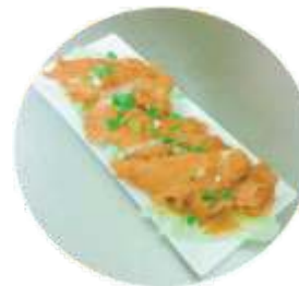
Almond Boneless Chicken