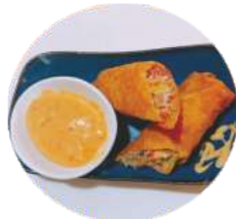
Corned Beef Egg Roll