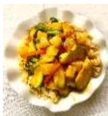
Caribbean Stir Fried