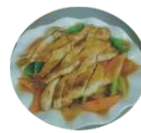
Asian Fusion with Chicken